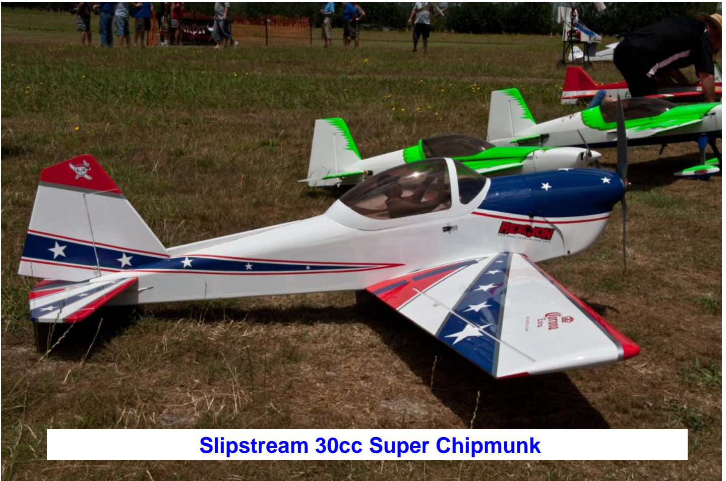
Slipstream 30cc Super Chipmunk