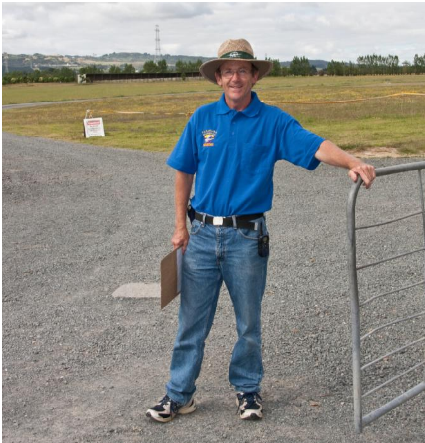
Welcome to PMAC. May I take your order?