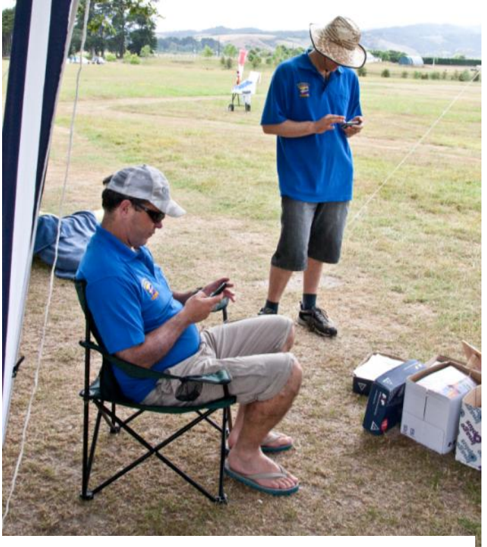
Where are you telling your wife that you are?