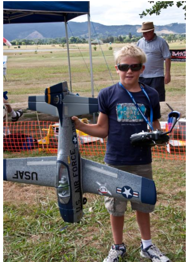
Hey look Dad, mines still in one piece. How's your Extra?