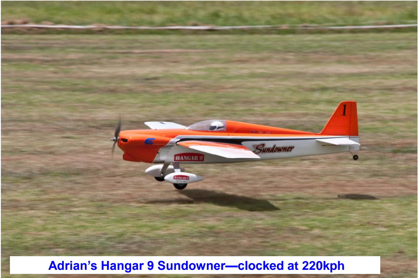
Adrian's Hangar 9 Sundowner—clocked at 220kph