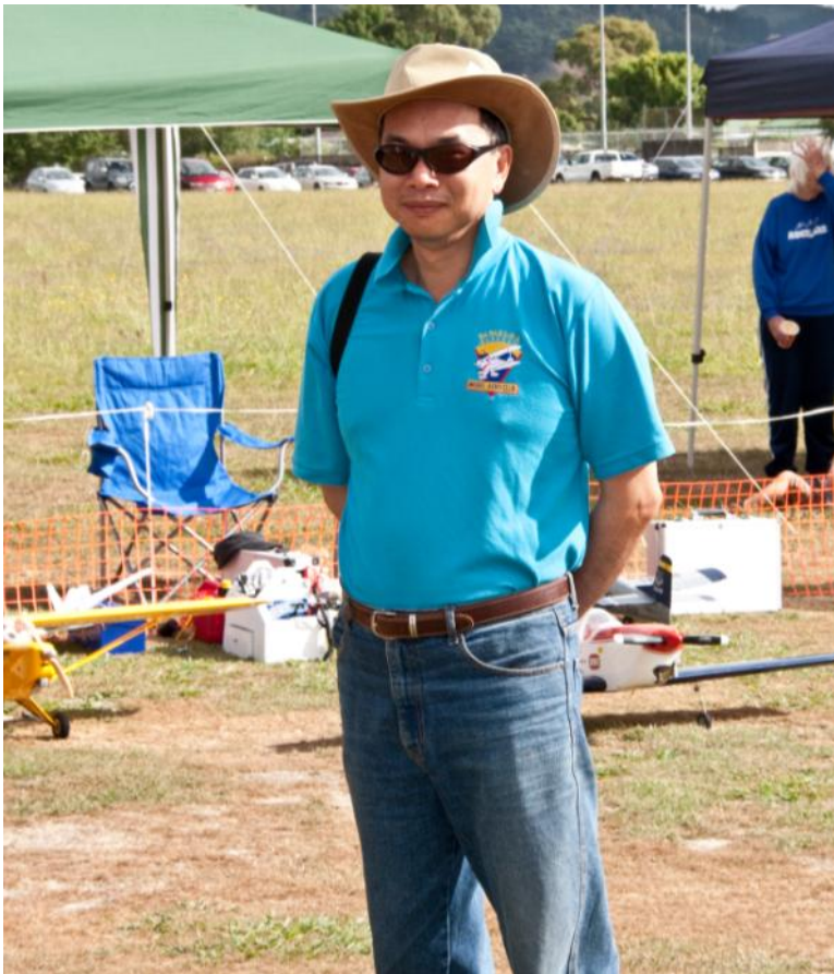
There's a new Sherriff in town!