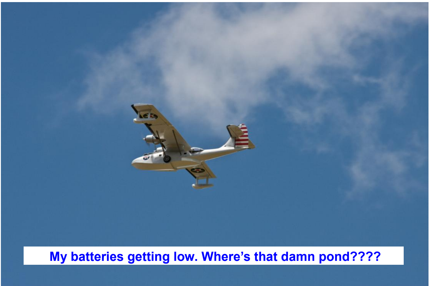
My batteries getting low. Where's that damn pond????