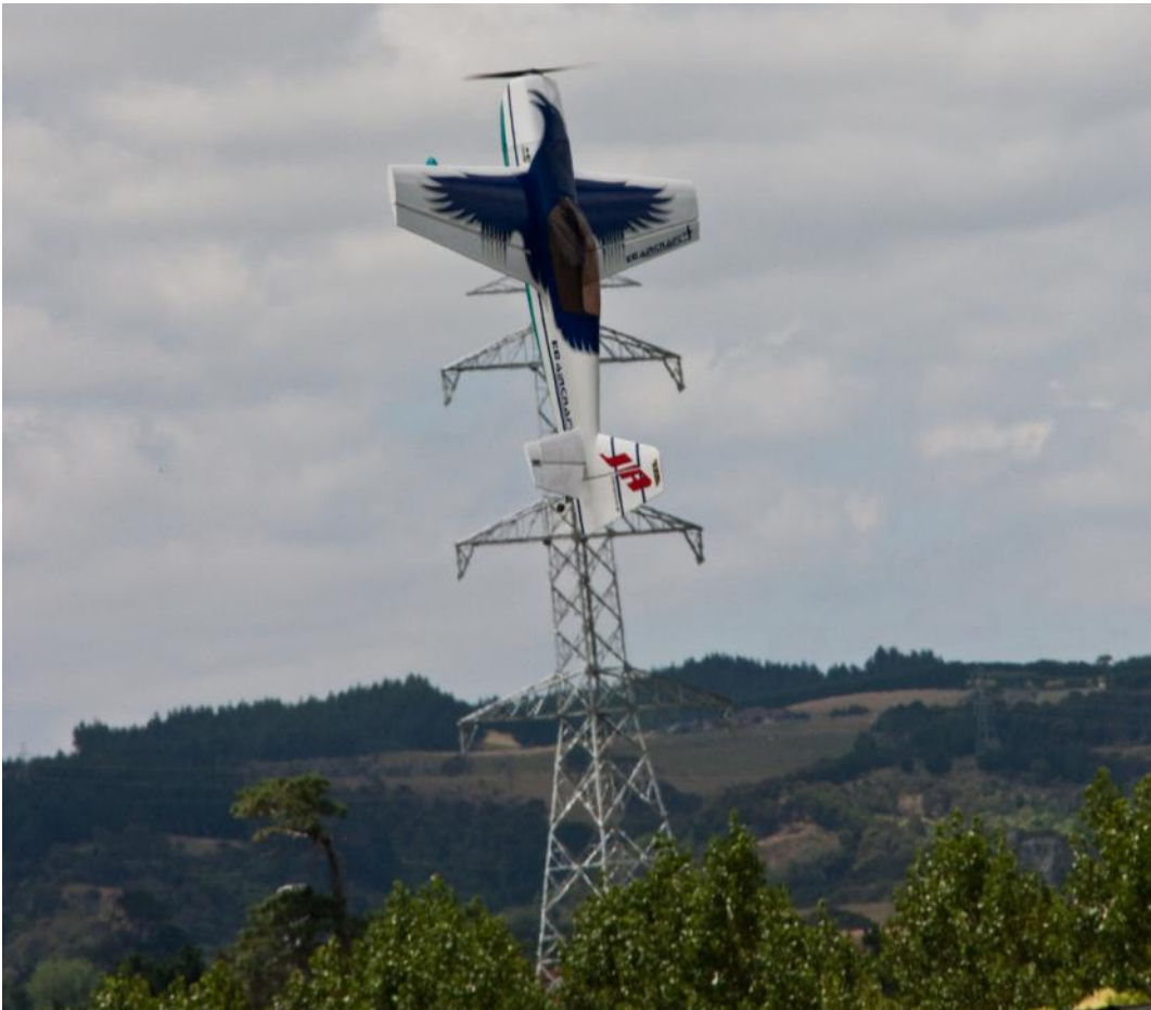
Mikey just stuck it on a pole for effect. Awesome Photo Terry.