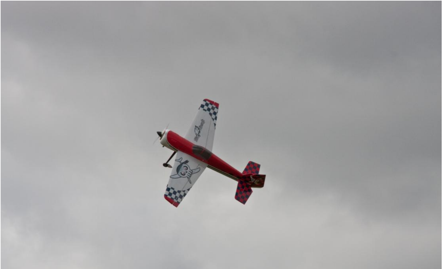
Matt's EG YAK—Probably the best plane ever!