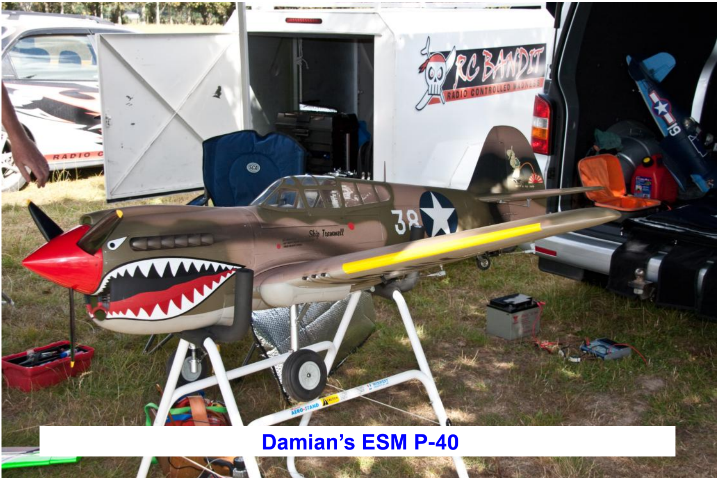
Damian's ESM P-40