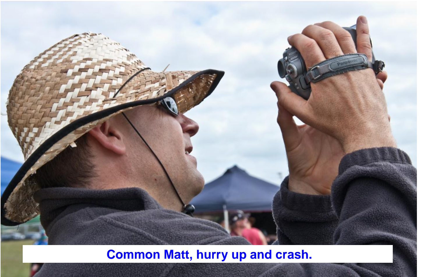
Common Matt, hurry up and crash.