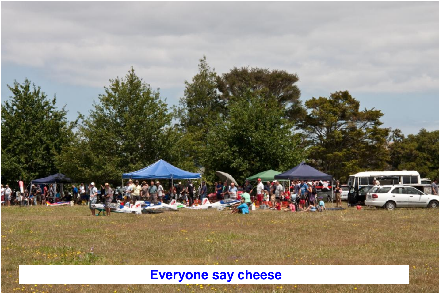
Everyone say cheese