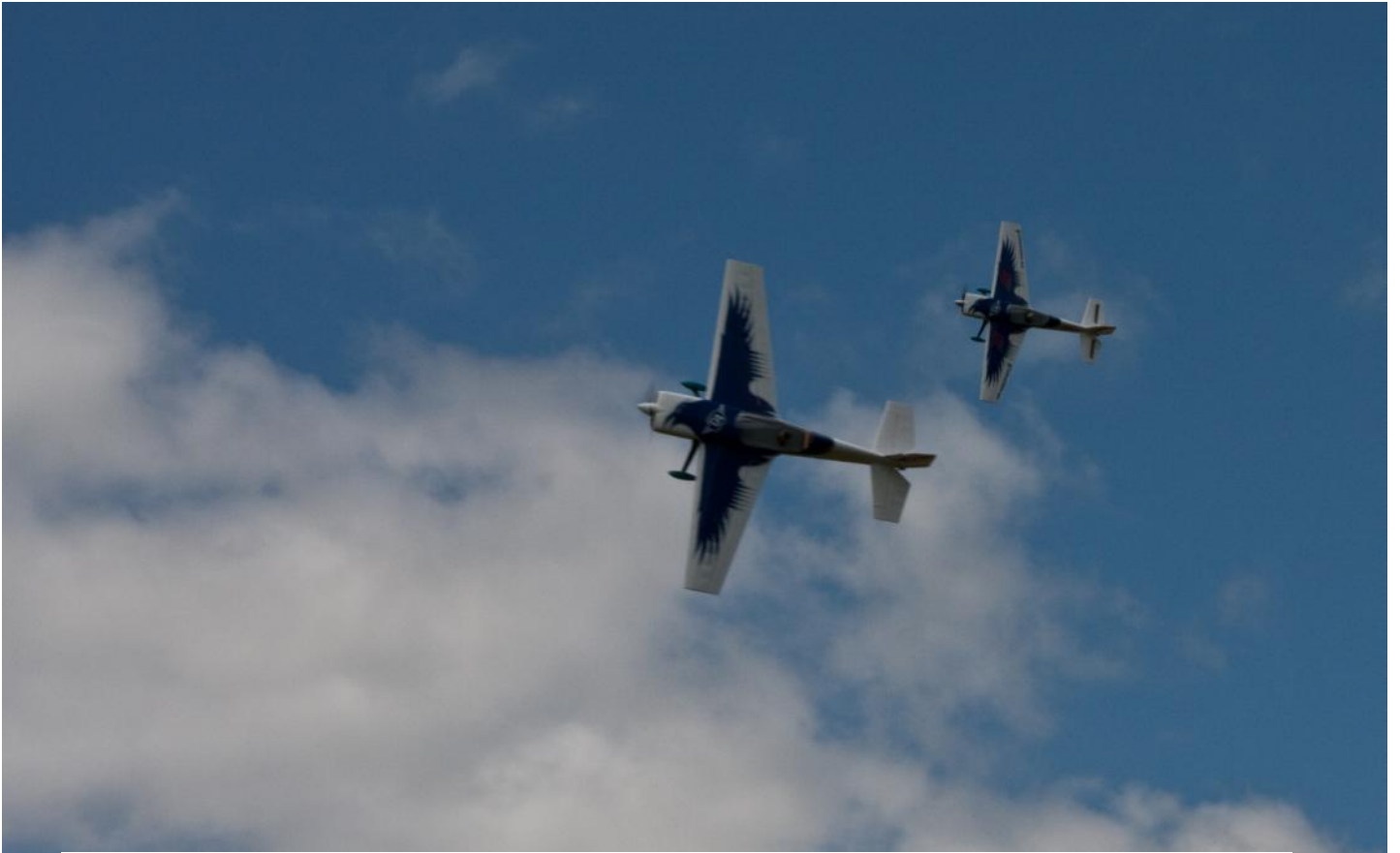
Frazer and Shaun—showing us how to do it.