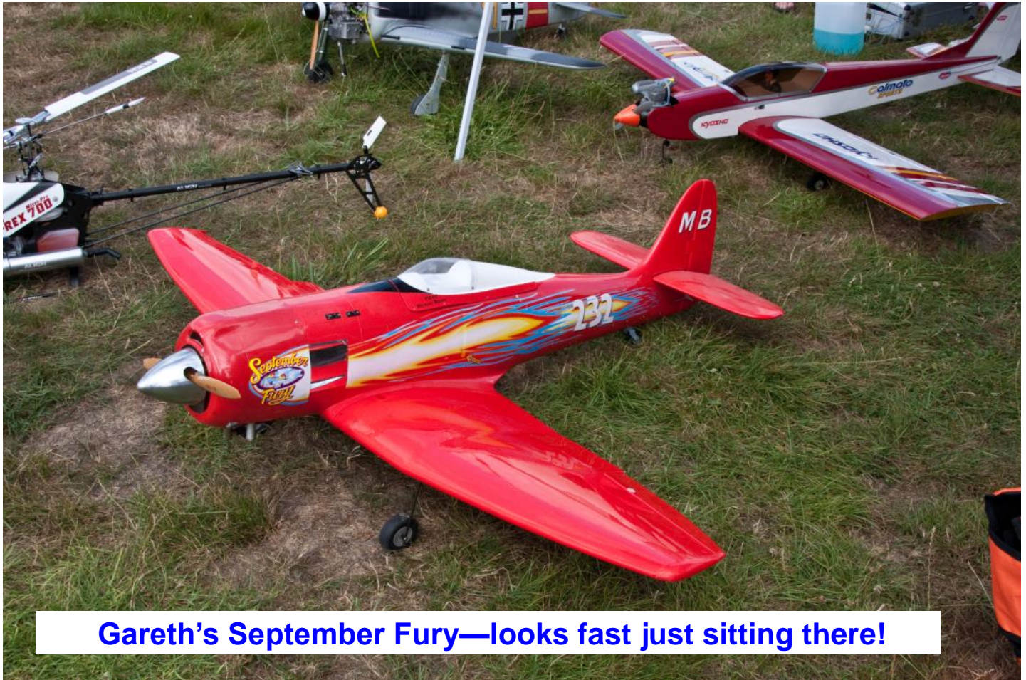
Gareth's September Fury—looks fast just sitting there!